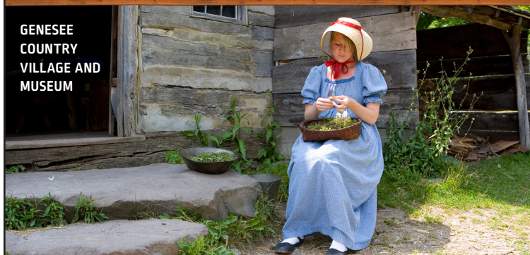
GENESEE COUNTRY VILLAGE AND MUSEUM