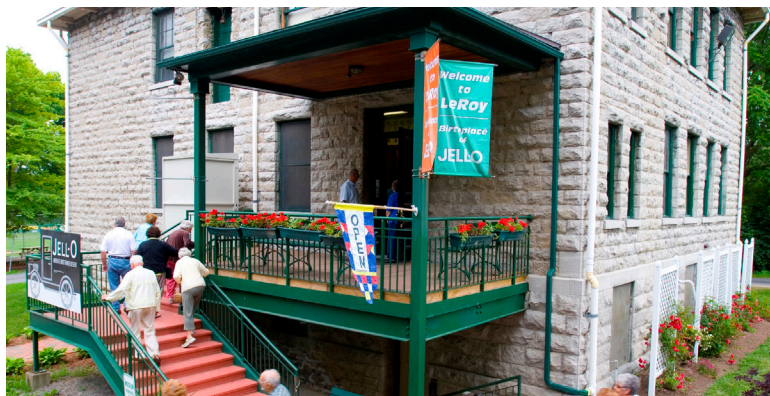
JELL-O GALLERY MUSEUM

The wiggly, jiggly dessert was invented in Le Roy, NY in 1897. Follow the JELL-O Brick Road to a fun exhibit of "America's Most Famous Dessert". » jellogallery.org