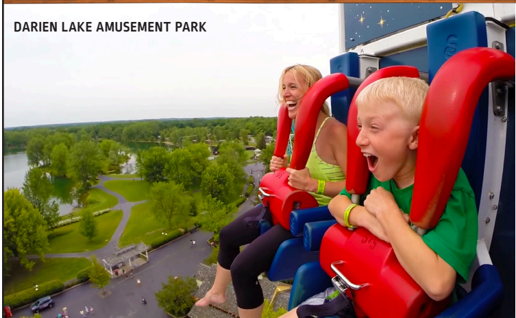
DARIEN LAKE AMUSEMENT PARK